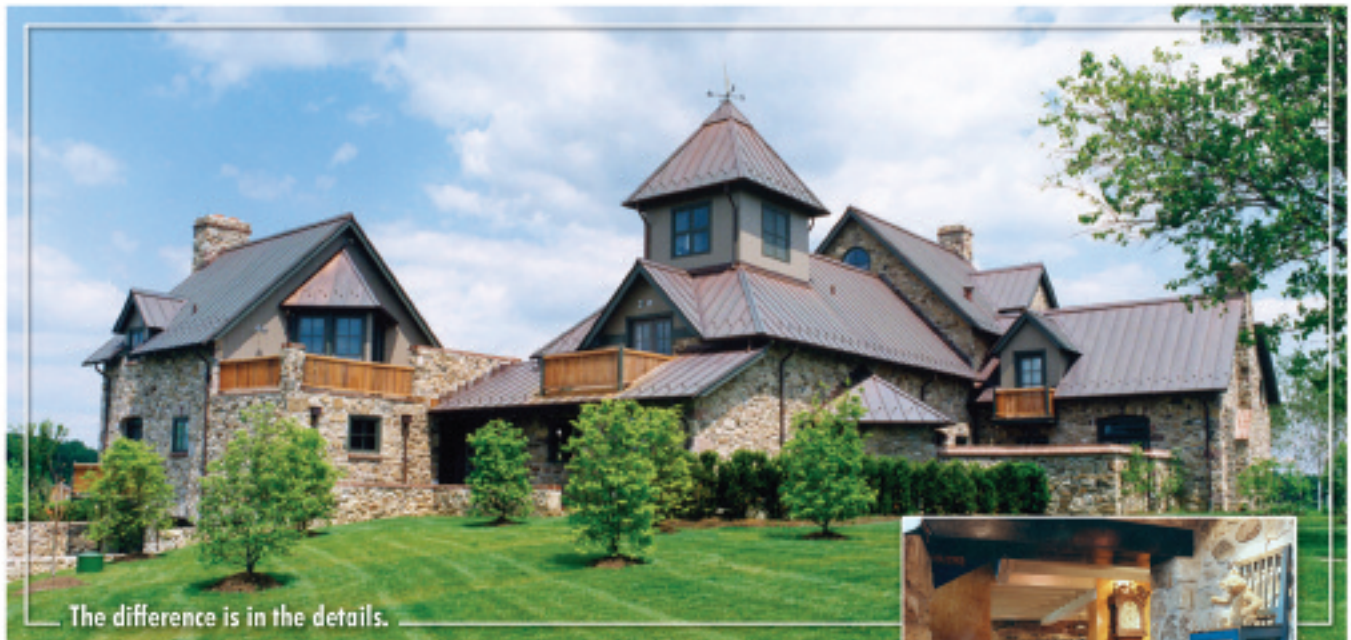
The difference is in the details.

“Phoenixville is an authentic 1870s steel town,” continues Chawaga, “and its rebirth is enticing a group of young professionals, who are moving from areas like Manayunk. There is a dramatic difference in Phoenixville’s per-